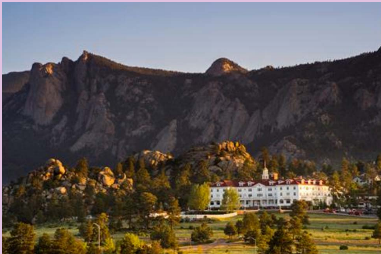
The Stanley Hotel, Estes Park, CO